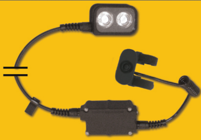
μRL (Micro RL)

White LED – IR LED – Visible laser – IR laser