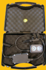
Transport case µRL