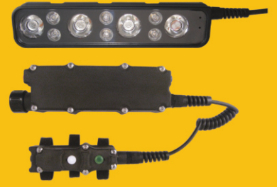
ENS RL 12 (B2LI)