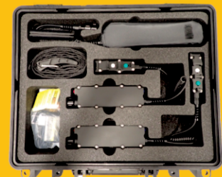
Transport case with foam (option)